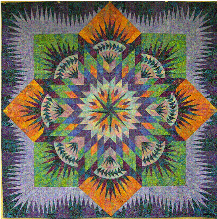
FVQI 2008 Raffle