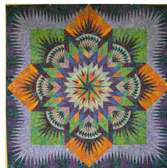
FVQI 2008 Raffle Quilt

It's at the Phelps Museum in preparation for the Barn Tour.